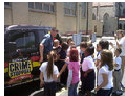
Crime Stoppers visits Guardian Angels School in Westport to discuss the program with students.

In 2009, advancing technology played a key role in that Crime Stoppers saw a dramatic increase in WebTip submissions, which as of this writing totaled nearly 1,500. The increasing prevalence of “social media” outlets led to the creation of a “Crime Stoppers Greater Kc” Facebook page which displays weekly fugitives, photos, upcoming events, and other program information. While not an anonymous source to submit information, a link is available to our secure WebTip submission page and we have already seen results with the arrest of at least two fugitives displayed on Facebook!