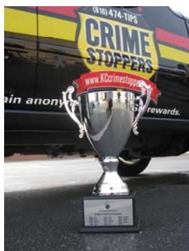
2009 Police vs Fire Battle for Blood, won by the Police for the 2 nd year in a row, Traveling Trophy.

2009 statistics included: 4,380 TIPS taken, 332 arrests made with 653 cases cleared and 54 firearms taken off the street. 146 fugitives were apprehended and 24 homicides, 51 robberies, and 16 aggravated assaults cleared. A total of $58,282 dollars in rewards were paid out to TIPSTERS. Several payouts also included Supplemental Reward Funds such as a Raytown quadruple homicide, a Burglary at Burke Elementary School, and a property damage offense in Liberty, Missouri.