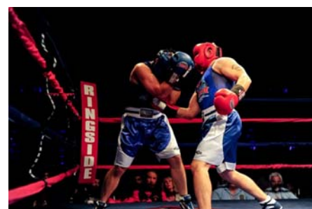
2009 Guns 'N Hoses Boxing Event

Although the economy was sluggish this year and some of the fundraisers and other revenues were down, SAFE did not suffer as much financially as other similar organizations. The golf tournament was down $4,100, Guns 'N Hoses down $27,000 and contributions down $12,000. In addition, investments lost about $33,000; however, even with all of the above loses, SAFE's overall balance increased from $497,864 to $522,819. All in all, it was a good year.